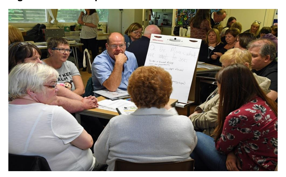
Figure 3: future aspirations

Participants worked in their groups, to identify what they would like to see happen in the area to support a thriving community hub, See Figure 3 below. They based these discussions on the dialogue and discussion generated in commenting on and scoring the area against the Place Standard themes.