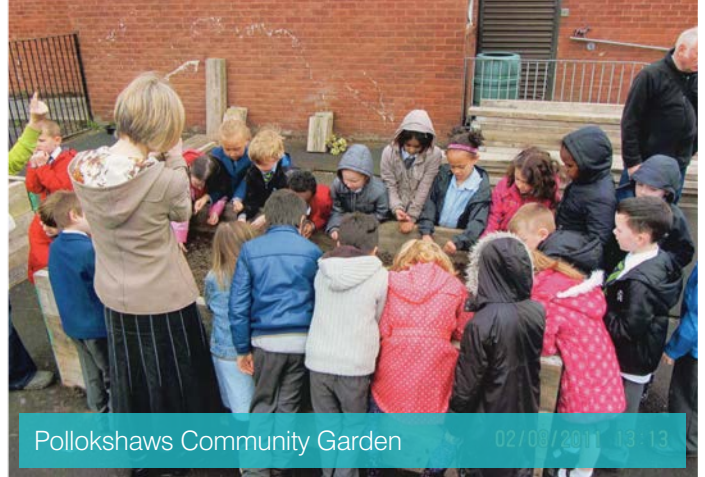
Pollokshaws Community Garden