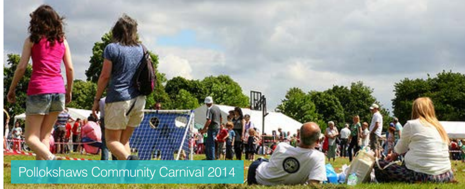
Pollokshaws Community Carnival 2014