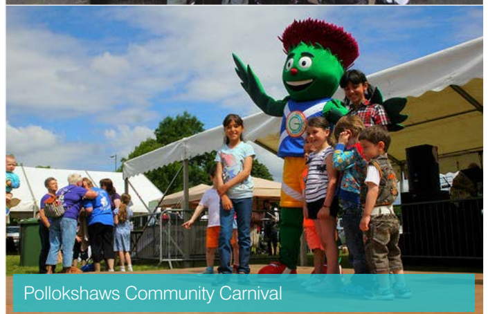
Pollokshaws Community Carnival