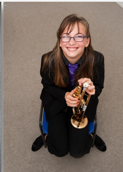
Big Noise Raploch participant, aged 6 and 15 years; 9 years engagement with programme