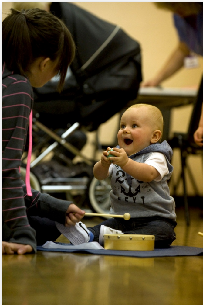
Big Noise Govanhill participant, aged 10 months old