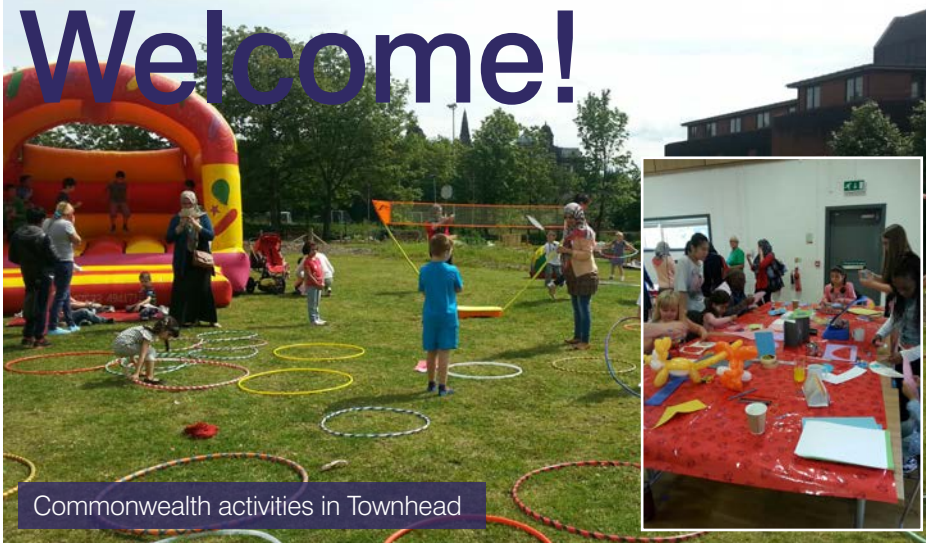
Commonwealth activities in Townhead