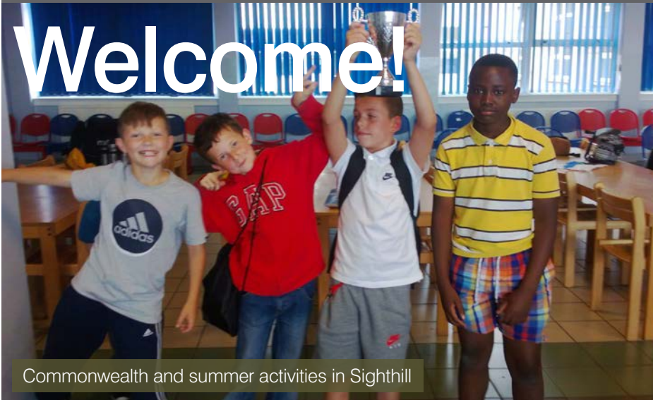
Commonwealth and summer activities in Sighthill