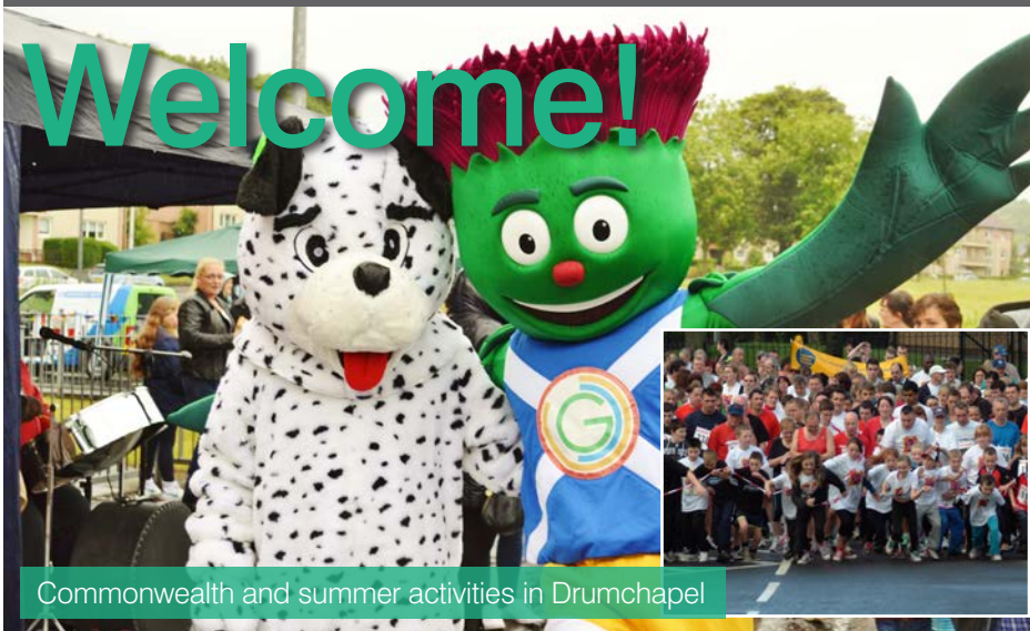
Commonwealth and summer activities in Drumchapel